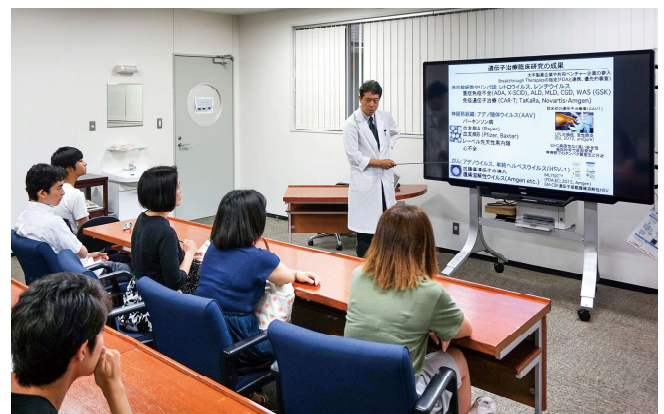
Used at open campus to hold mock lessons for prospective students