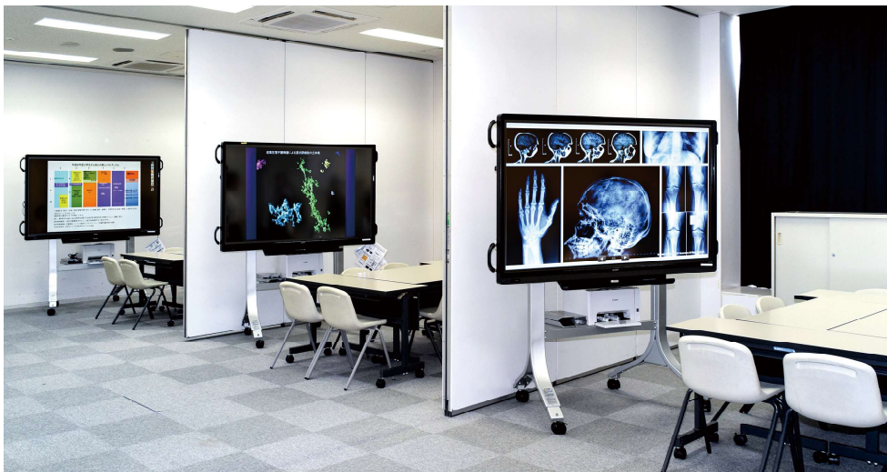
36 units were simultaneously implemented into all classrooms for small-group learning