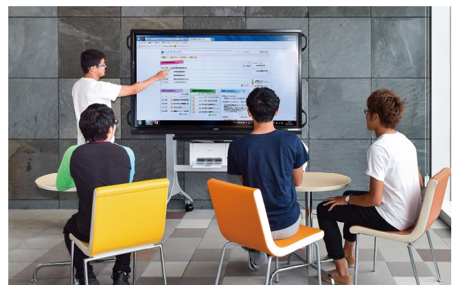
Installed at free spaces where students can freely exchange opinions