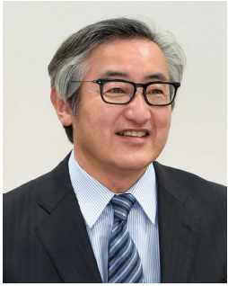
Nippon Medical School