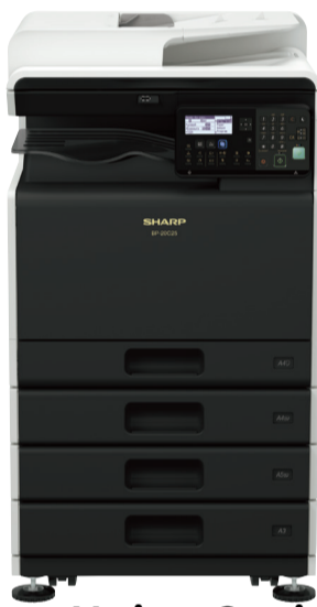
Base Unit + Options (4 Paper Trays)

*The measurement of the on-screen MFP may not appear exact in some cases.