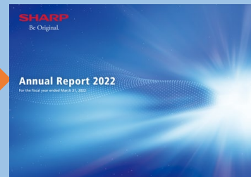
Annual Report (Integrated Report)