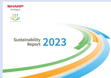
Sustainability Report (This report)