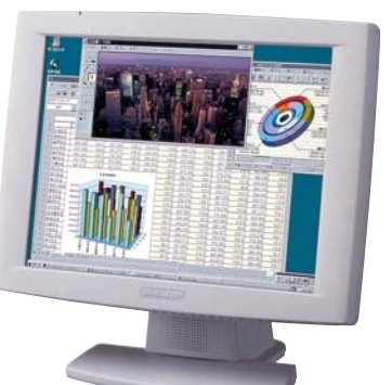
Space-saving CE-LT14M color display using a 13.8-inch Super-V LCD (1997)

Sharp developed a Super VA (Viewing Angle) LCD that enabled wide viewing angles by dividing each pixel in the LCD array into left and right domains and aligning the liquid crystal molecules at different angles. Sharp also developed the Super HA (High Aperture Ratio) LCD. This yielded a bright