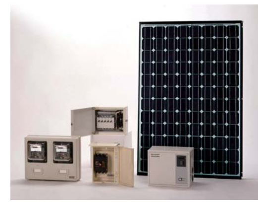
Example of a residential solar power system (1994)

In 1994, Sharp introduced a new residential solar power system consisting of monocrystalline solar cells with high conversion efficiency and a compact power conditioner (inverter) to handle the grid interconnection. Sharp's Sunvista residential solar power system—along with other examples of advanced PV systems, such as houses with pre-installed solar power systems—won awards in the New Energy Foundation's Commendation for 21st Century New Energy Equipment/System program (New Energy Awards) for six years in a row, beginning the first year the awards were instituted (fiscal 1996).