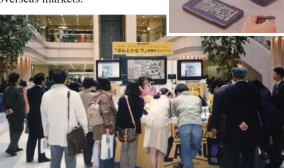
The PI-3000 could exchange data with a PC via infrared communication (top); A hands-on Zaurus event at Haneda Airport, Tokyo (March 1994)

businesspeople. In October 1996, sales of the Zaurus in Japan topped one million units. Sharp also developed Zaurus models for corporate users and overseas markets.