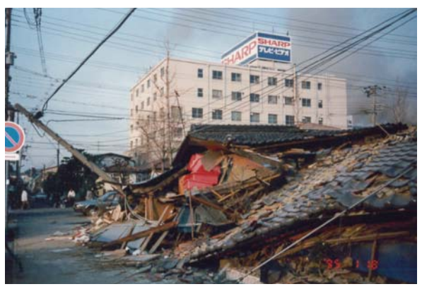
Devastation around the Sharp Kobe Building

Early on the morning of January 17, 1995, a major earthquake struck the southern part of Hyogo Prefecture. It inflicted enormous damage to the northern part of Awaji Island and throughout the Osaka-Kobe area and claimed over 6,400 lives.