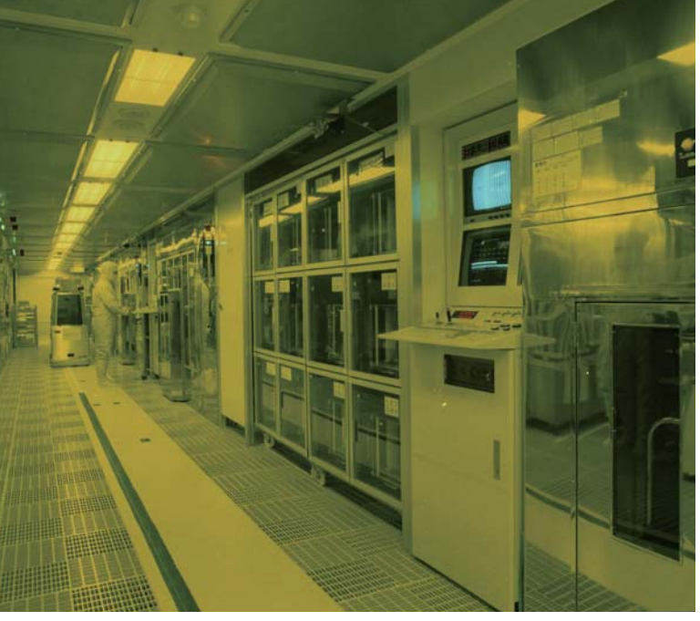
Microfabrication processing line for color TFT LCDs (Tenri Plant)

Subsequently, the Mie Plant (Taki-cho, Mie Prefecture), which had become fully operational in October 1995, used 2.5-generation glass substrates (400 × 505 mm) to produce large-format color TFT LCDs sized 11.3 inches and larger. The introduction of CIM (computer-integrated manufacturing), along with a super-intelligent automated transport system that crisscrossed all processes, further increased production efficiency.