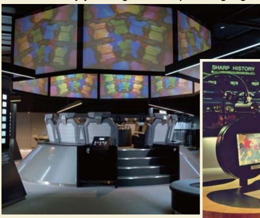
Flying Utopia exhibit guided visitors through a futuristic world using vivid images and powerful sound

High Technology Hall in the Makuhari Building allowed visitors to enjoy learning about Sharp's cutting-edge technologies