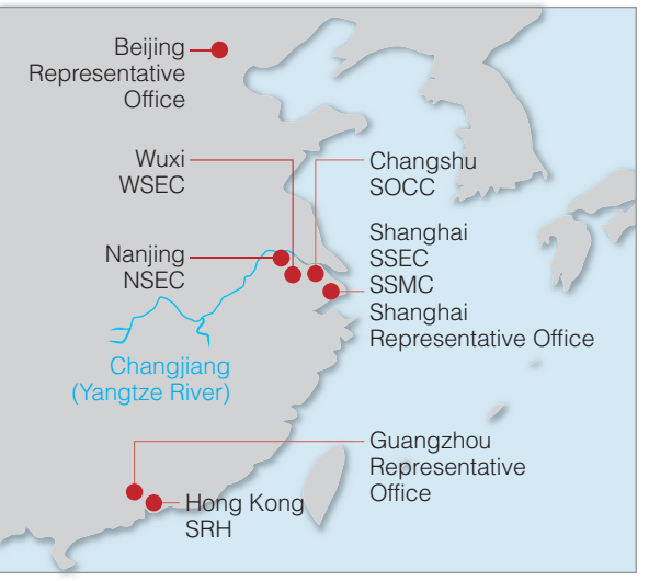
Sharp bases in China (as of 1997)

established Wuxi Sharp Electronic Components Co., Ltd. (WSEC) in 1994. WSEC was tasked with the manufacture and sales of STN LCDs. Sharp also established Nanjing Sharp Electronics Co., Ltd. (NSEC) in 1996 as a production and sales company for AV products, and Shanghai Sharp Mold and Manufacturing Systems Co., Ltd. (SSMC) in 1997 for the manufacture and sales of molds and other production tooling.