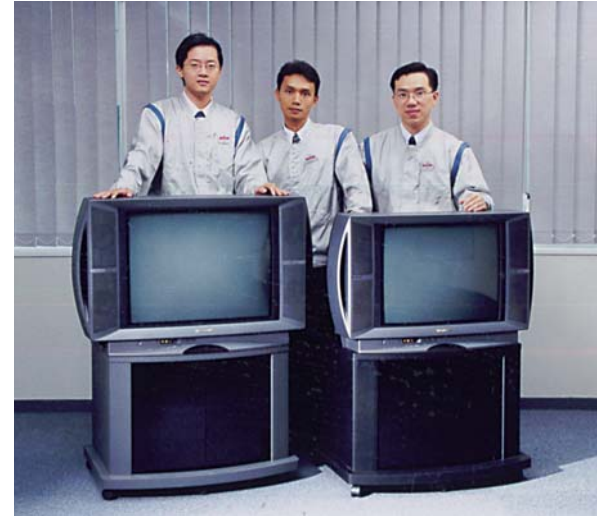
Q Beat series color TVs for the Asian market were designed and developed by SEM (1998). They were made and sold in countries such as Thailand, Indonesia, India, and Malaysia.

In the 1990s, personal incomes in Asian countries were on the rise, increasing the area's attractiveness as a target for sales. At the hub of this region was Sharp Electronics (Malaysia) Sdn. Bhd. (SEM), established in 1995. SEM undertook design and development of TVs, VCRs, and audio equipment for Sharp's Asian production bases. It also supplied components for manufacture and repair to Sharp's production sites around the world.