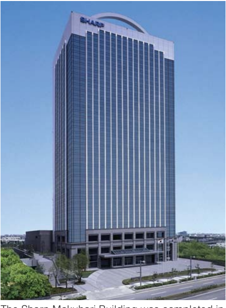
The Sharp Makuhari Building was completed in Mihama-ku, Chiba City, Chiba Prefecture

At the same time the new building was opened, the Multimedia Systems Research and Development Center was