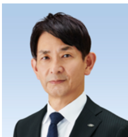
Senior Executive Managing Officer Chief Technical Officer, Chairman of SIPI