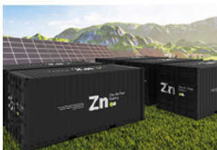
Energy generation, storage, and conservation