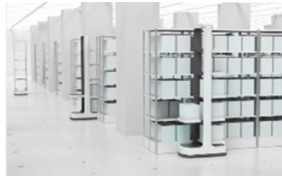
Industrial DX & Robotics

In line with changing customer needs in the mobility market, we accelerate Sharp's unique EV development that focuses on the time vehicles are stationary. In industrial DX and robotics, we strengthen the development of Sharp's image analysis, robot control, and applied AI technologies, and connect these technologies with future physical AI.