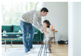
Quality of Life