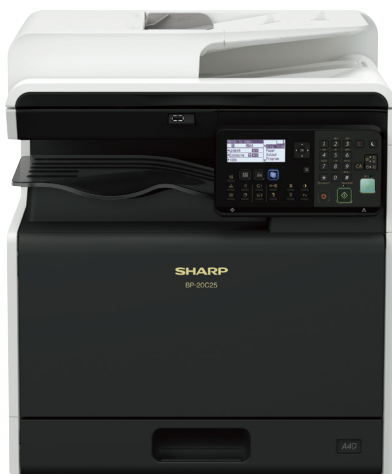
Base Unit (1 Paper Tray)

*The measurement of the on-screen MFP may not appear exact in some cases.